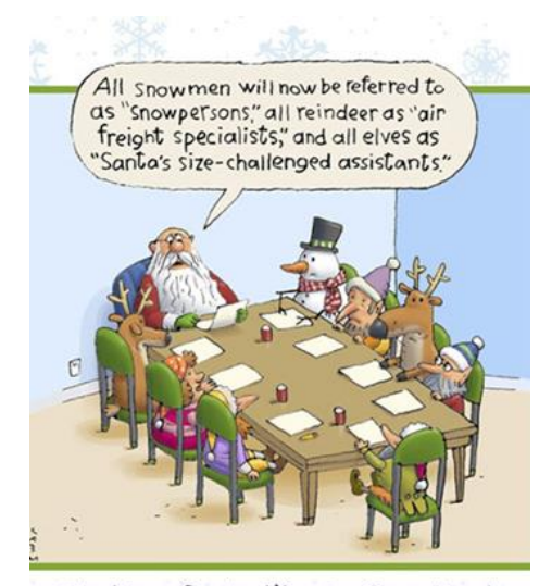
The Year Santa Hired a Consultant